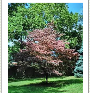
Pink tree? Our white dogwood in disguise

An act of love, taking on some of the world's pain, increases the courage, love and hope of all – Dorothy Day